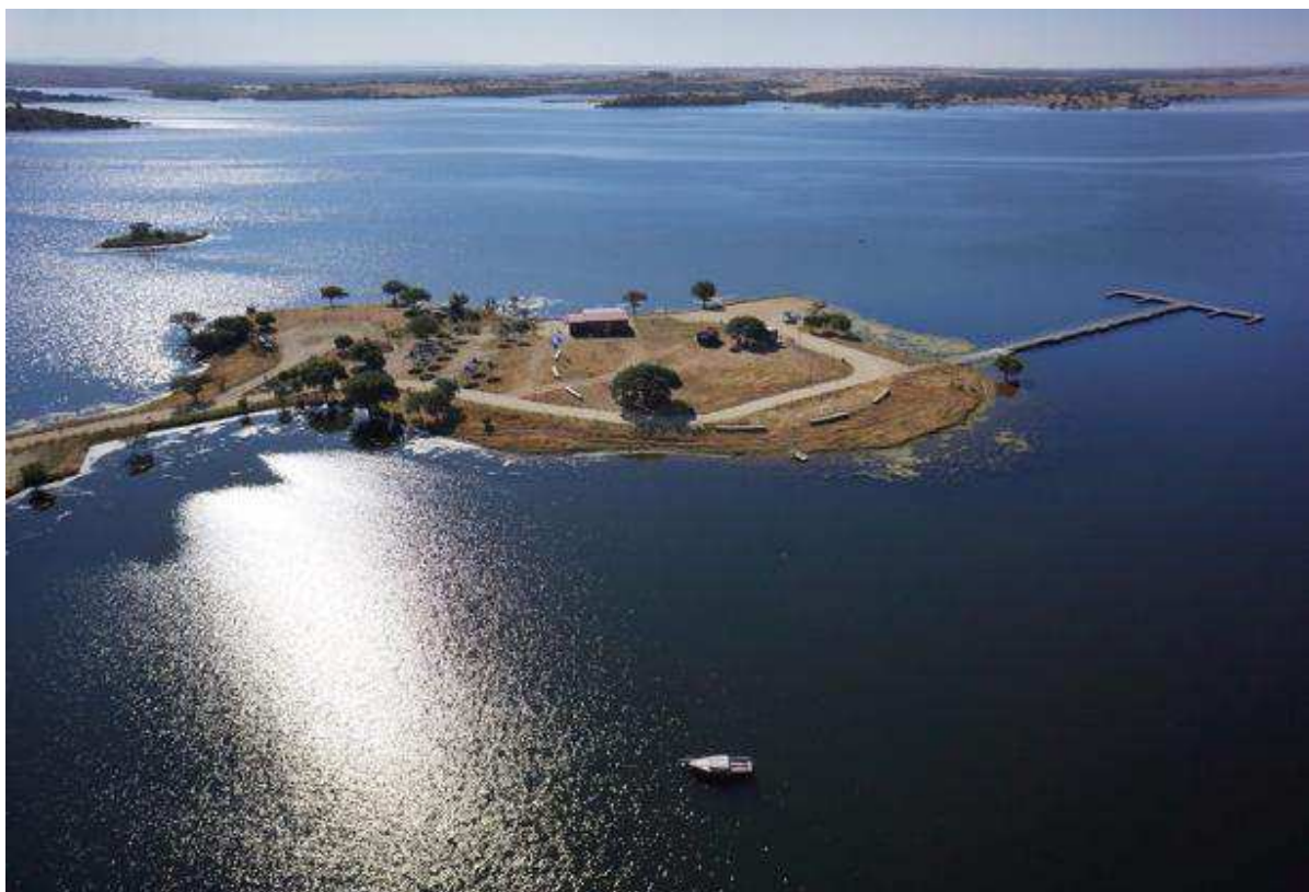
Race Office (Centro Náutico Reguengos de Monsaraz) and Camping area.